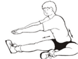
16. Hamstring Stretch (commence with knee slightly bent, then push knee straight as tension allows, push chest towards foot)