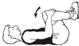
13. Lumbar Flexion Stretch (be gentle if sore)