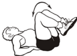
14. Lumbar Rotation Stretch (rotate legs one side, then the other side, draw in and brace stomach muscles at the same time, breathe)