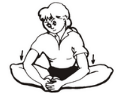
17. Adductor Stretch (push down with elbows on knees very gently, keep back straight)

MORNING HOMEWORK – this is the minimum and children can do more. Be Very Careful as doing wrongly can cause damage.