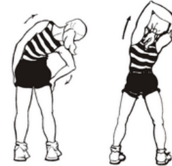
11. Lateral Flexion Stretch (one side, then the other, push pelvis across as you bend)