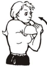
8. Supraspinatus Stretch (keep elbow parallel to ground)