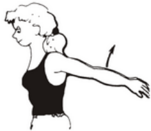
7. Bicep Stretch (hands apart)