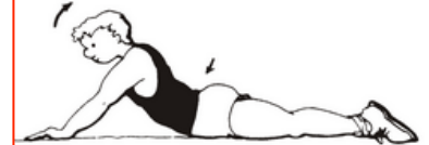
12. Lumbar Extension and Abdominal Stretch (be gentle if sore)